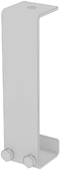
Ceiling Bracket (TRSHDUP-BK1) Qty: N x Rails + 1

Ceiling Bracket is used to secure Rails together and mount directly to ceiling.